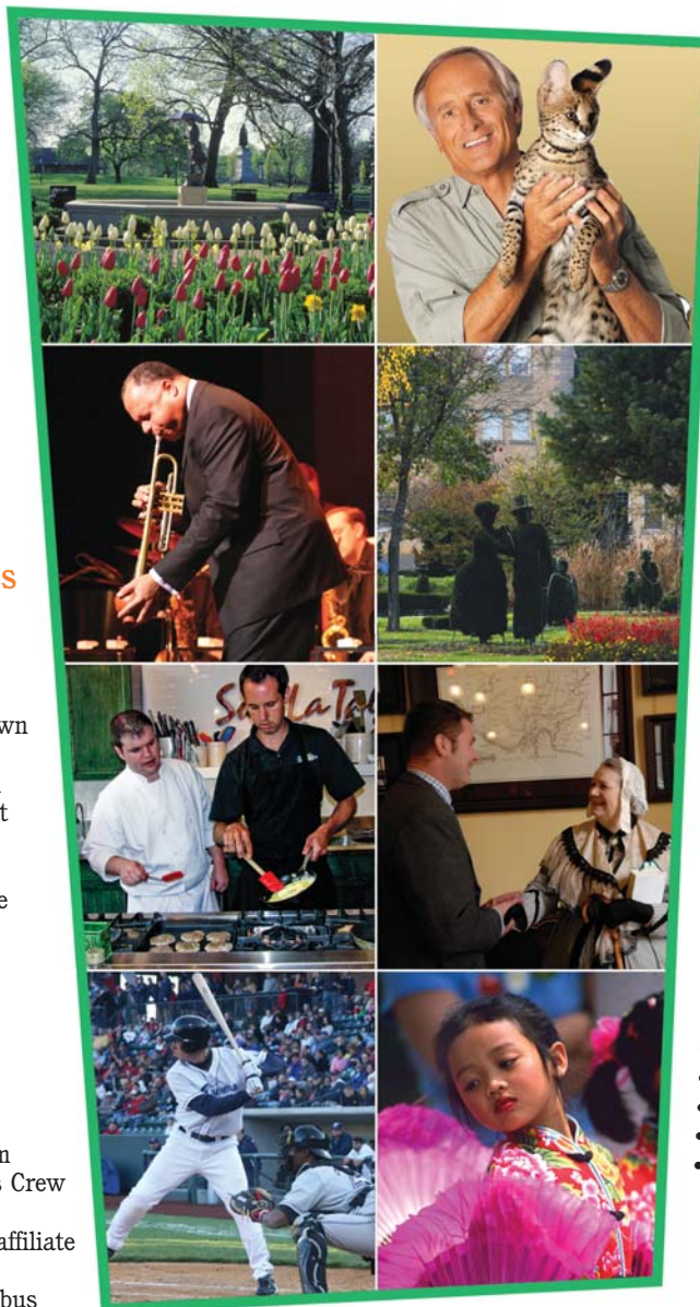
Images (clockwise from top left): German Village, Columbus Zoo and Aquarium, Topiary Garden, Ohio Statehouse, Asian Festival, Columbus Clippers, Sur La Table at Easton Town Center and Columbus Jazz Orchestra.